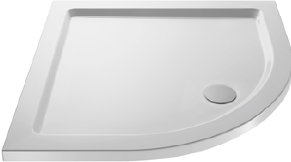
NTP105 - 800 x 800 QUADRANT TRAY